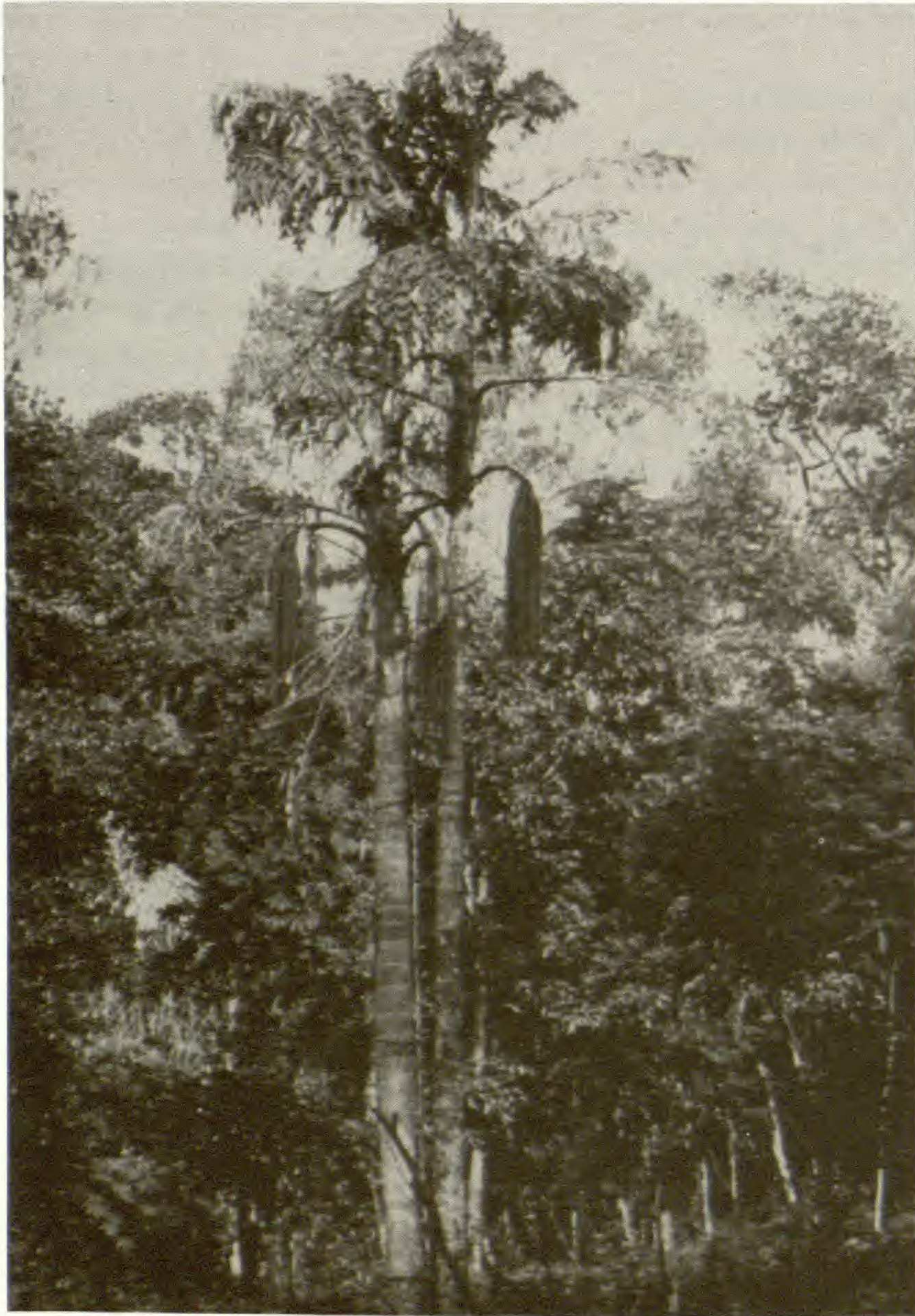
FIG. 2.—The Kitul palm ( Caryota urens L.).

green, and shiny. The fishtail-like shape of the outward-turned 15 cm long leaflets give the palm its English name.